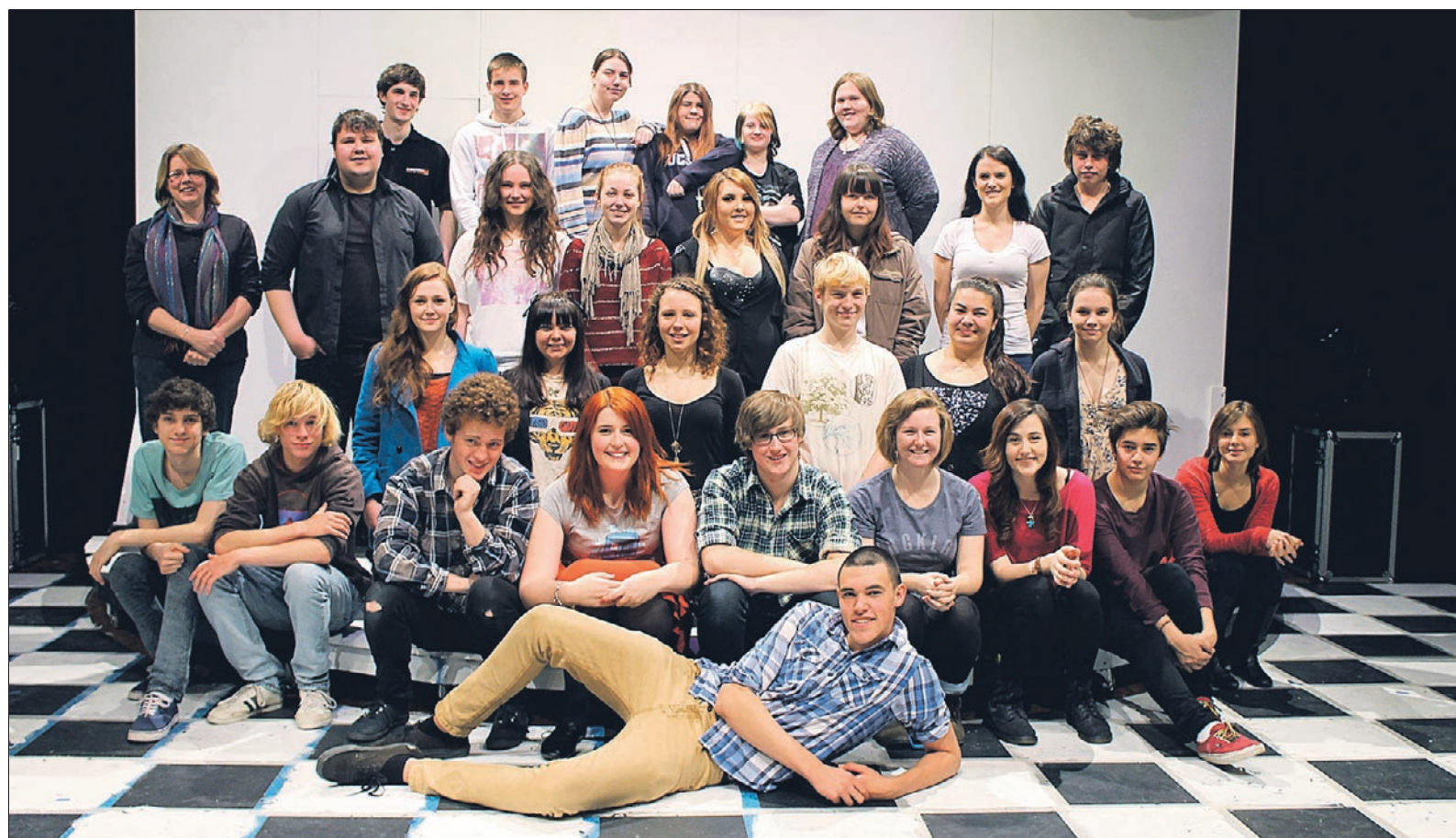
Talented: The cast and crew of UCSSC Lake Ginninderra's performance of The Wedding Singer .

The college provides a modern and well-resourced learning environment, offering students more than 70 courses of recognised study. Student pathways are tailored towards achievement in traditional subject areas but are complemented by a diverse